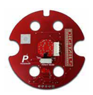
Passenger Side LED panel shown above

Lay out all four LED panels. Each LED panel is labeled "D" and "P" to determine driver side or passenger side respectively.