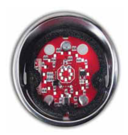
1963-64 housing and LED panel