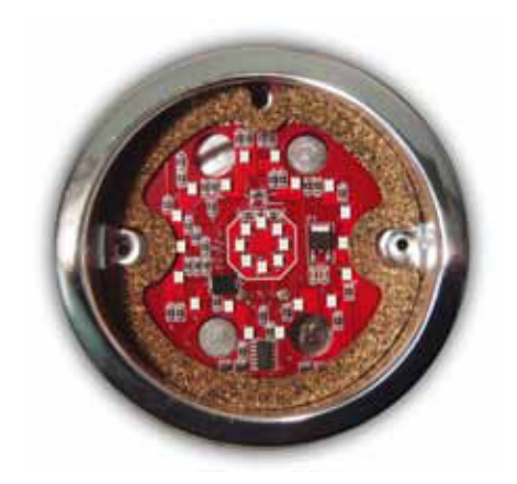
1962 housing and LED panel

Remove the lens and gasket. Test fit the LED panel with the wording facing up. The housing bolt studs will fit into the LED panel cut outs. Once you are satisfied, remove the adhesive tape paper and secure the panel into place.